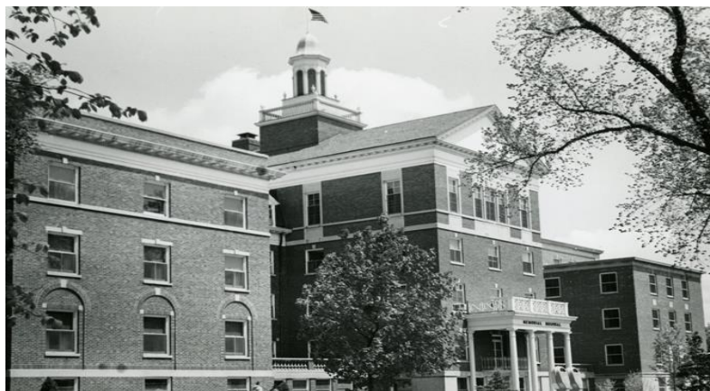
Memorial Hospital of Du Page County, Avon Road and Schiller Street, 1966. M2013.1.46

After consideration of several locations, the hospital's site committee purchased property at Avon and Schiller in March 1925, and there was a ground-breaking ceremony on November 3, 1925.